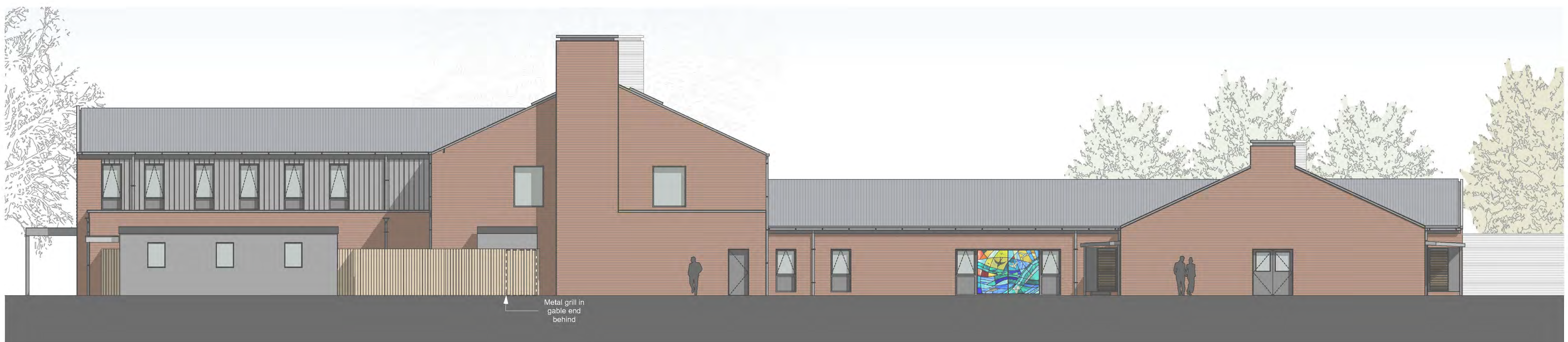
E-N1 North Building Elevation