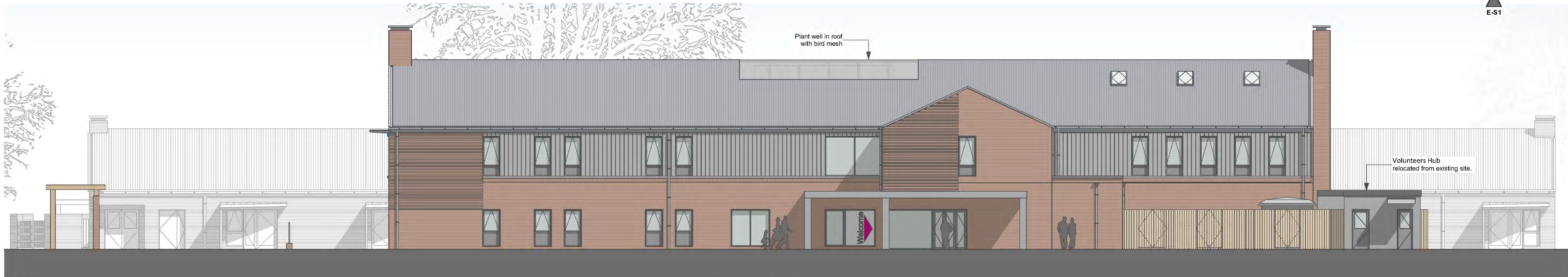
E-E1 East Building Elevation